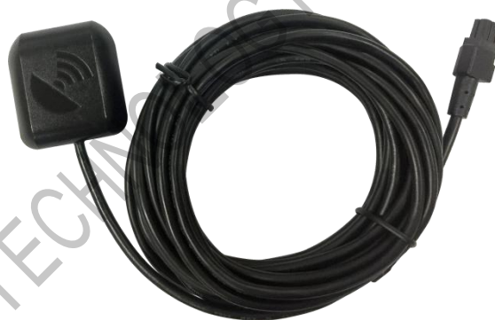
Figure: AGM-41R-20W004 Top View